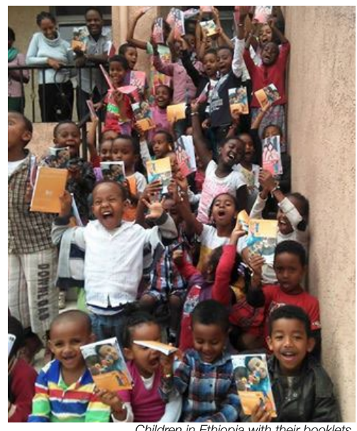
Children in Ethiopia with their booklets.

As promised, we are focusing in the Winter BES News on Africa and the development of Bibletime throughout this continent. This includes up to date prayer requests and accounts of what God is doing in many countries.