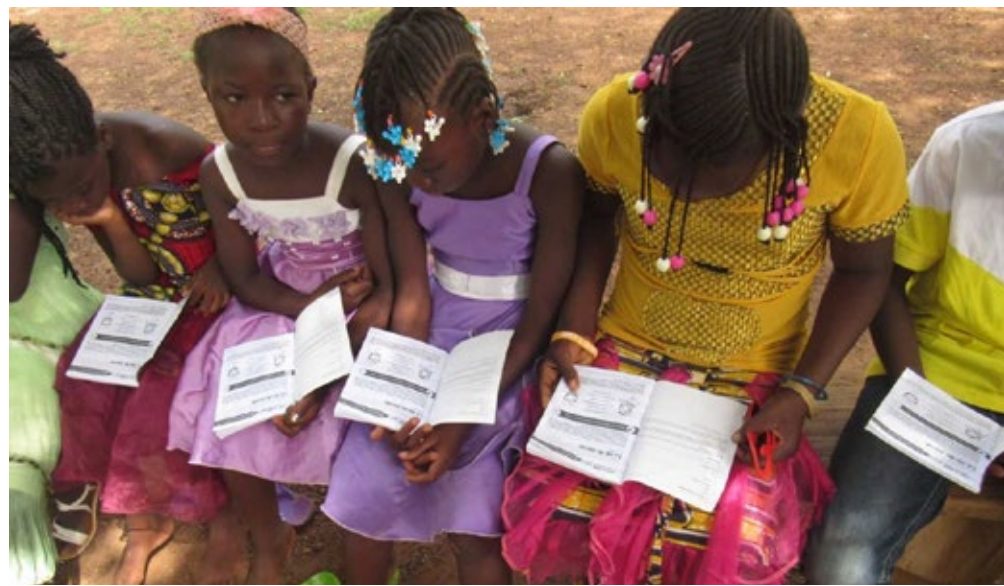
Children in Burkina Faso with their booklets