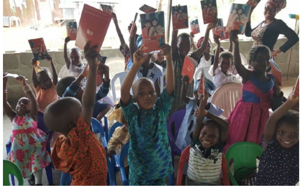
Children with their Bibletime booklets in Nigeria.