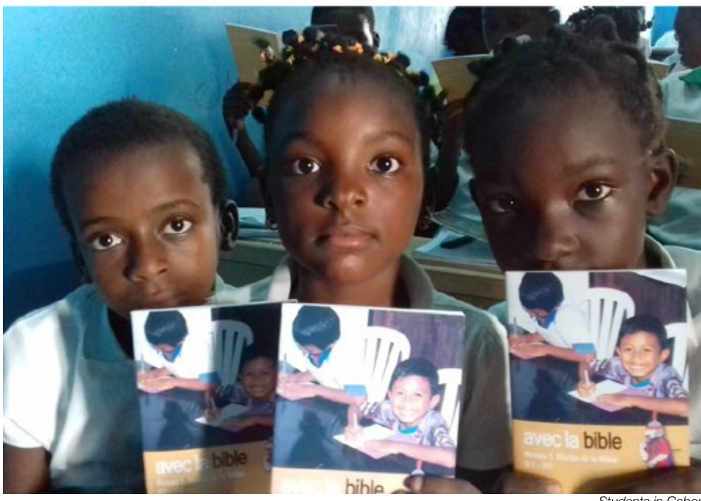
Students in Gabon

The Swahili translation is on-going and is taking some time to complete. We have delivered close to 8000 A4 Bibletime lessons to a school in Arusha, and we are scheduled to deliver more materials to a church in Arusha during November. Praise God for the enthusiasm of the children and teachers from this region to learn about God through Bibletime! We have now nearly distributed all of the C series, but unfortunately, the pace of the translation and proofreading of the A series has been slow since June. The potential in Tanzania for the use