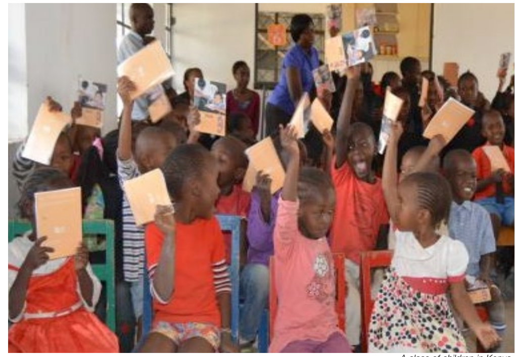
A class of children in Kenya.