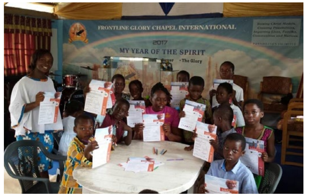
A class in Ghana