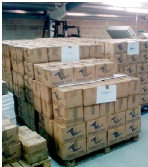
Lessons waiting to be shipped from Revival Movement