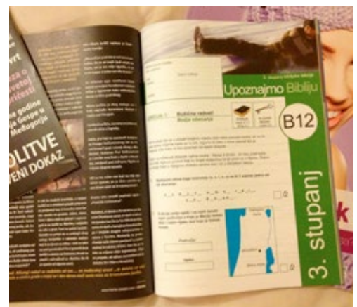
The lessons printed in a Croatian magazine