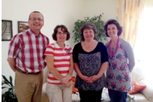
Some of the French Translation Team