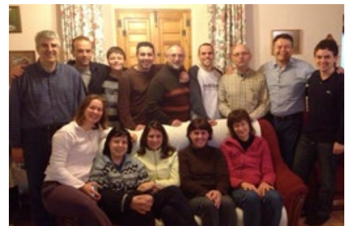
The Spanish Translation Team