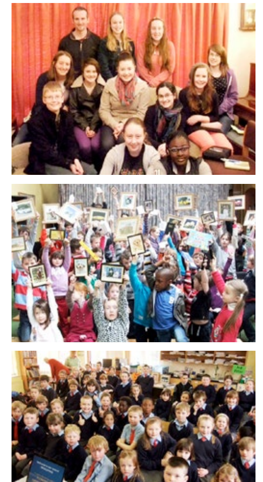
Top: Local Teenager's Bible Class in our home Middle: Prizegiving in Adare, Co Limerick Bottom: Visit to Clonenagh National School