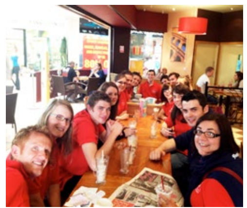
Camp leaders at the Fermanagh and Tyrone PBS Camp

We have been greatly encouraged recently with an increase in the number of students, mainly from schools. In the 90's when we took on the administration, we had approximately 180 students. We praise God that today we have 1630 regular students completing the lessons. This is likely to increase as we have a definite interest in level zero with an order for 70 lessons already for Jan 2013. There are many challenges as we increase the student numbers; new teachers, administration and rising costs. The Lord has been faithful over many years and we look to Him to meet the various needs, as the psalmist writes in Psalm121 - "From where does my help come? My help comes from the LORD, who made heaven and earth. Thank you for your continued prayers.