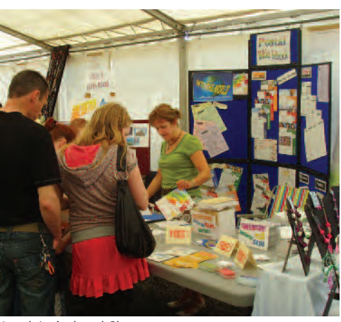
Local Agricultural Show

Opportunity was taken to chat with the parents as the children were completing the competition. Other passers-by were offered a Gospel Tract and also the monthly daily reading publication of the United Christian Broadcasters. There were some who declined - but many others were happy to receive the literature. We were encouraged by the prompt return of a number of PBS application forms soon after the weekend.