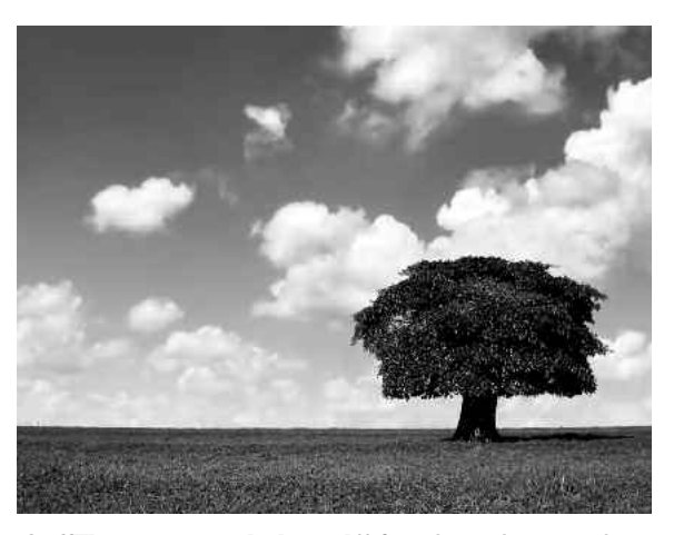
2. "The sun was darkened," for three hours when the Son of God was dying for our sins. (Luke 23: 44 & 45)

I. "The sun stood still in the midst of Heaven," to allow Joshua's army to defeat the Amorites. (Joshua 10: 13 & 14)