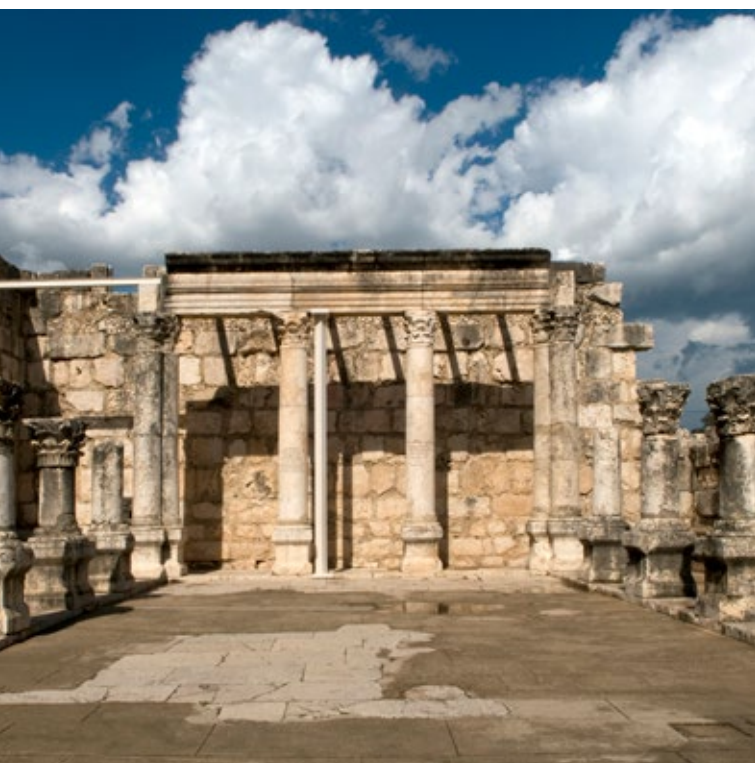
Ruins of the ancient Great Synagogue at Capernaum

Mark's Gospel is, of course, about the Lord Jesus. What has He to say about Him? Here are a few things worth noting: