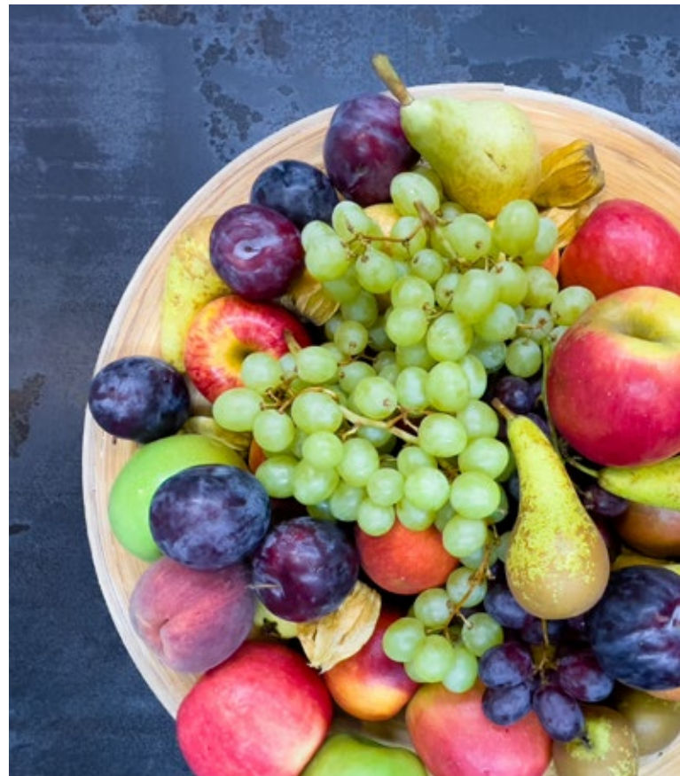
This is the third of three units on God the Holy Spirit .

In Galatians 5 , the “fruit of the Spirit” is set in very sharp contrast to the “works of the flesh” . ( verses 19-21 ) The ‘flesh’ is our sinful, fallen nature which, even though we are now Christians and have a new nature, is still very much with us! An unending conflict goes on! (See verse 17, “For the desires of the flesh are against the Spirit, and the desires of the Spirit are against the flesh...” ) If we allow the flesh to take control, we can quite easily become guilty of the horrible things listed in verses 19-21 . We can, however, have victory over the flesh through the Holy Spirit who is in us. Our responsibility is to open up our lives more and more to Him, through faith and obedience. This is what Galatians 5: 16 means when it says: “Walk by the Spirit, and you will not gratify the desires of the flesh” .