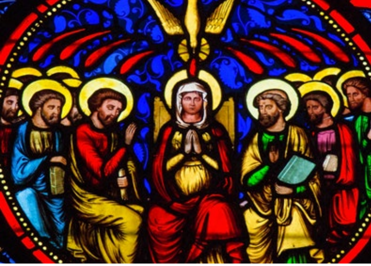
Stained Glass window depicting Pentecost, in Bayeux Cathedral, France.

Even today, the Spirit convicts of sin, as John 16: 7-11 teaches us. We may not fully understand how conscience and the Holy Spirit interact. We should, however, be thankful when the Holy Spirit rebukes us, for sin is always serious in God's sight!