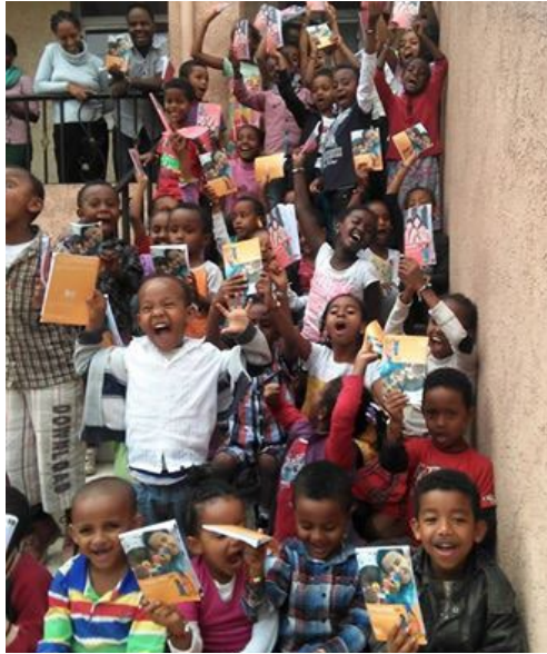
Children in Ethiopia with their booklets.

As promised, we are focusing in the Winter BES News on Africa and the development of Bibletime throughout this continent. This includes up to date prayer requests and accounts of what God is doing in many countries.