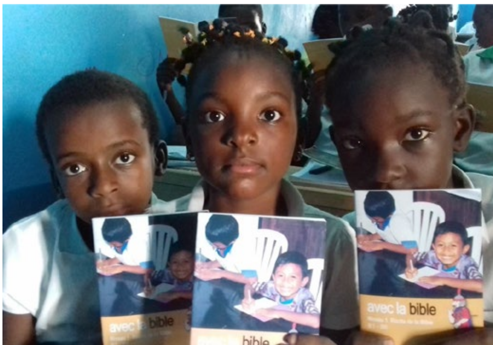
Students in Gabon.

The team at ZAM in Germany are using French Bibletime resources in the following countries with their co-workers; Chad, Congo, Central African Republic, Niger, Gabon and Ivory Coast. They have requested the next print run from Revival Movement of 1,300,000 booklets for distribution throughout Africa. We praise God for these partnerships, opportunities and value prayer for resources to fulfil the requests.