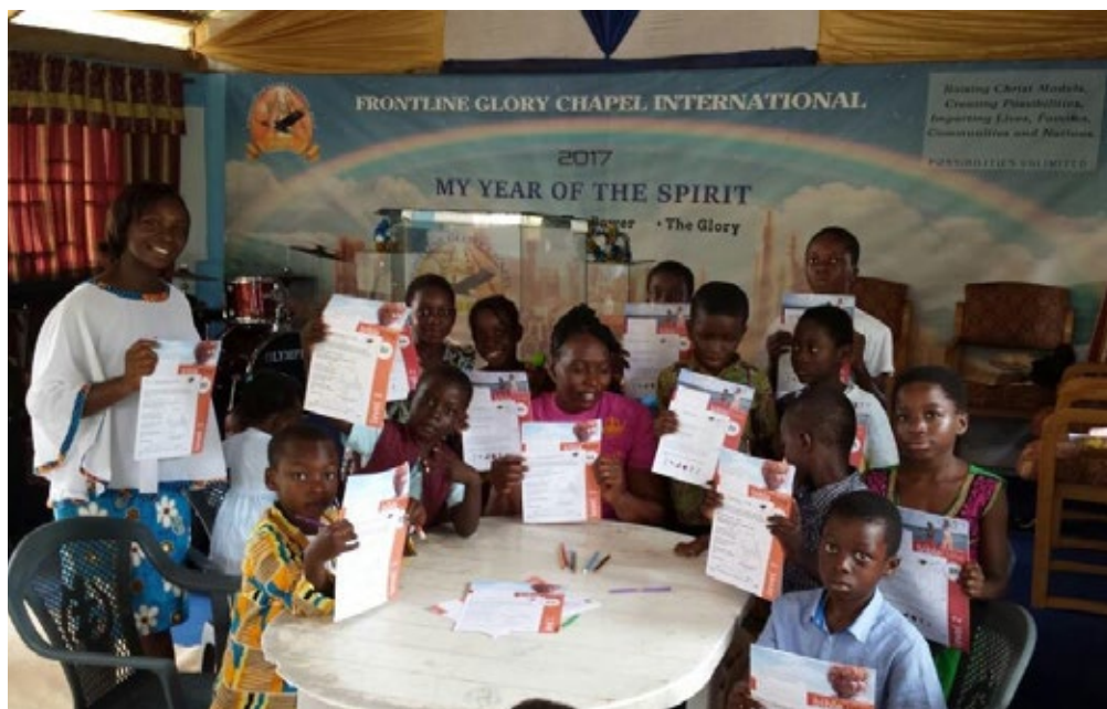
A class in Ghana.