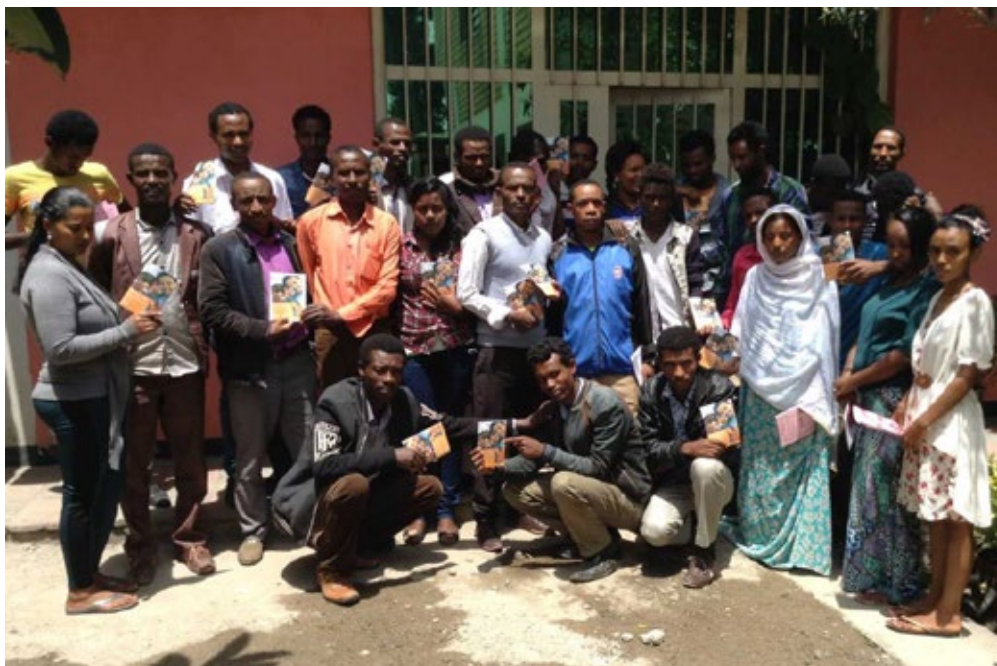
The team in Ethiopia.