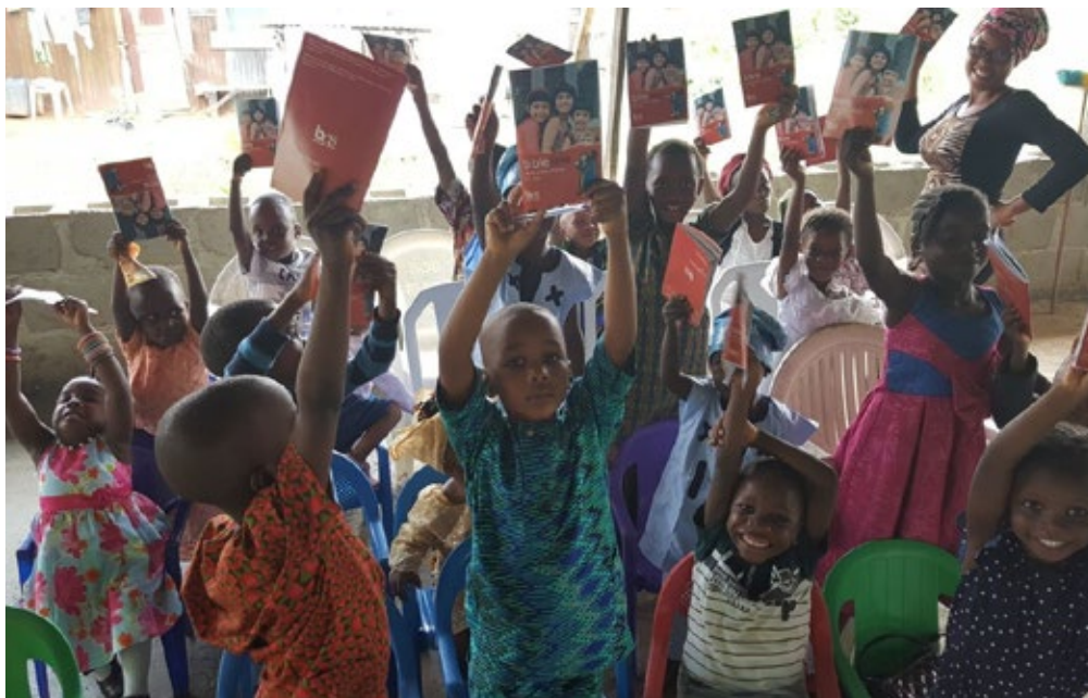
Children with their Bibletime booklets in Nigeria.