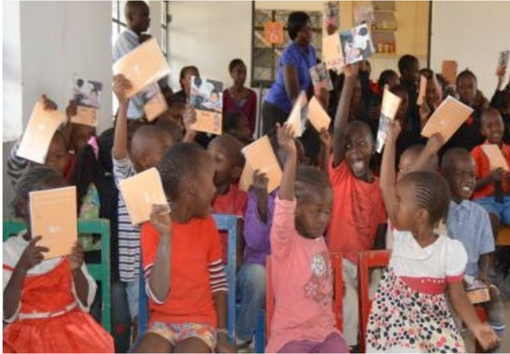
A class of children in Kenya.