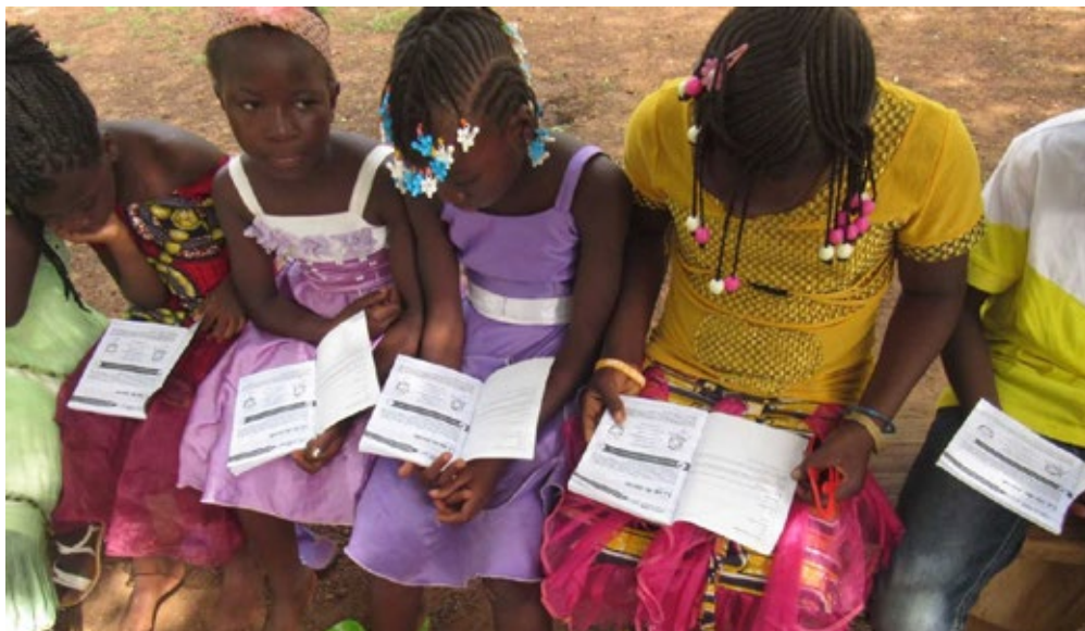
Children in Burkina Faso with their booklets.