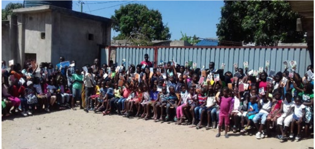
A school in Mozambique.