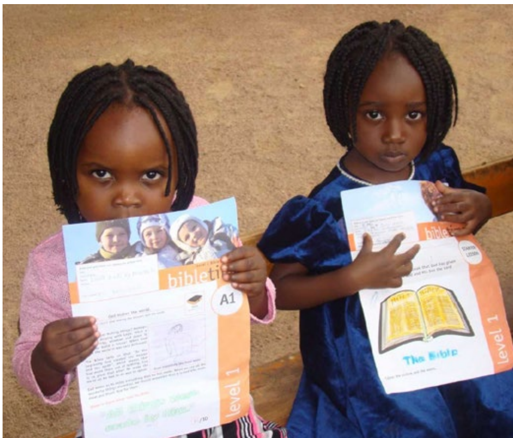
Children in Zambia.