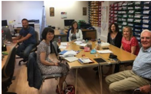
The editorial team at work.

The Editorial work continues and we anticipate being able to complete three years of the revised Level 1 in eight pages by the Summer of 2019. Our Designer is now working on Level 1 A5 booklet which will have 96 pages rather than the original 48, incorporating the new Level 1 lesson. The other exciting development is that Revival Movement have now obtained a printing press that can print our booklets in colour. Previously, the cover has been in colour, but the pages inside have just been in black and white. This will make the booklets far more attractive. It will mean a lot of work to produce the new templates, but we see that this is the way forward and we value prayer as Steve McDonald takes the lead in this. Please pray for our Designers as they work so hard on many Bibletime materials in different languages and in different formats.