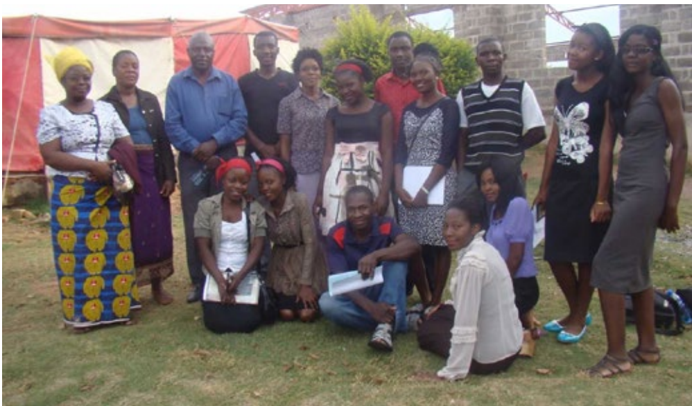
Teachers after training at one church in Zambia.