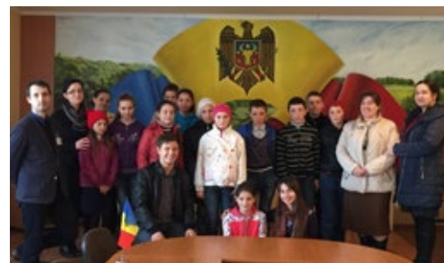
The Moldova team.

This March CMAID organized a meeting for Bibletime students in the south of Moldova. Out of 252 registered students, 15 children attended. Each child received a diploma and small gift. To the team's surprise, some of the children who came were those who had stopped completing Bibletime. They were given the lessons again with the hope that they will resume their study. Please pray that the team in Moldova would be a living witness for them, so that the Lord can work in the hearts of the people there.