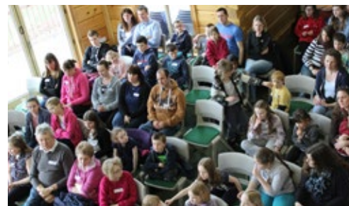
People at the UBM Postal Bible Club's birthday.

Over 100 children, parents and markers met together in April for the Postal Bible Club's 19th birthday. They had singing, memory verses, stories and quizzes, with archery, canoeing, football and rounders during the day. The children were also able to exchange some of their points for books and prizes. Please continue to pray for the 250 children as they learn from their Bibletime each month and for the markers who encourage the children with comments and letters.