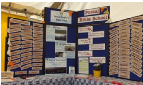
The PBS stand at the Norfolk Show.