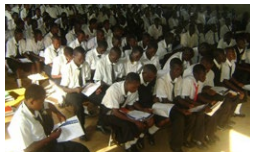
Teens For Christ in Kenya

Praise God for the churches who have been very faithful and consistent in using the BES lessons every month. Thank God for more and more churches who are enrolling for BES lessons for their children each day through our Emmaus students. Please pray for the church leaders and teachers to be able to bring in reports on time when they are needed.