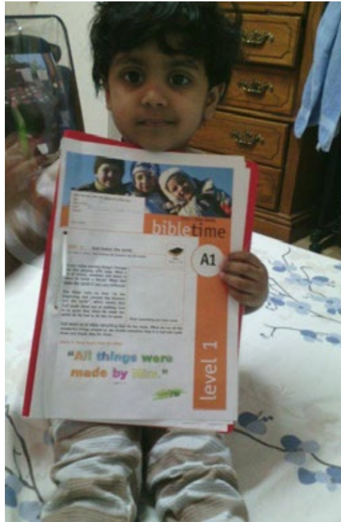
Child in India