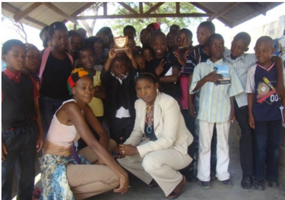
Some of the winners at the Bible Quiz day in Zambia

We praise God for the growth of the BES work in Zambia and pray for God's provision for funds to help with all the costs associated with continued growth.