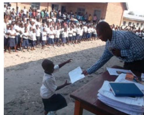
Child receiving a lesson in Congo