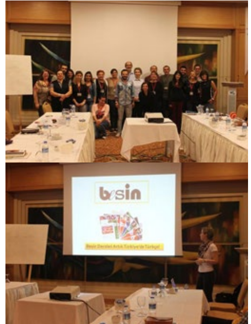
Training week in Turkey.

Pray for the completion of the translation work and all those involved in translation and design.