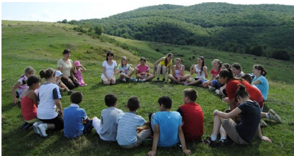
Camp in Romania (Oradea).

Thank God for the provision of the Bibletime lessons and pray that from September they will have a great impact in public schools in