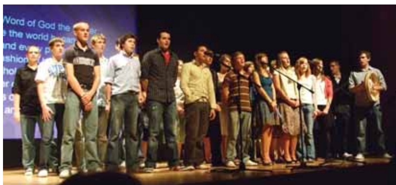
The choir made up of PBS students and camp leaders at the celebration in Craigavon.