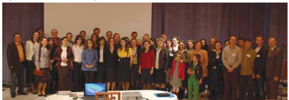
Attendees of the conference in Cluj, Romania.

I am very thankful for the job you all did here and maybe you will feel encouraged to know that there are results (feeble, but still results). Thus, we have 2 new markers following the conference, some people who ensured us that the PBS work has entered their prayer list after the conference and also a big improvement in the comments of those who participated at the training on Friday evening. So, thank you so much!