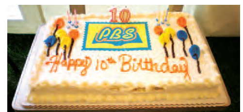
Happy Birthday PBS Canada!

we have had the privilege in the past to share the Gospel. It's hard to believe it's 10 years since the first student enrolled in July 1999, and we thank the Lord for His goodness and faithfulness over these years.