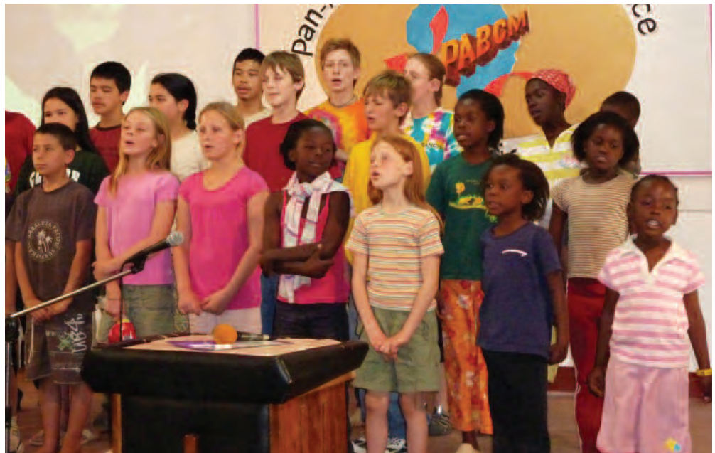
Children singing at PABCM venue.