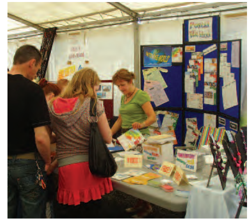
Local Agricultural Show

Opportunity was taken to chat with the parents as the children were completing the competition. Other passers-by were offered a Gospel Tract and also the monthly daily reading publication of the United Christian Broadcasters. There were some who declined - but many others were happy to receive the literature. We were encouraged by the prompt return of a number of PBS application forms soon after the weekend.